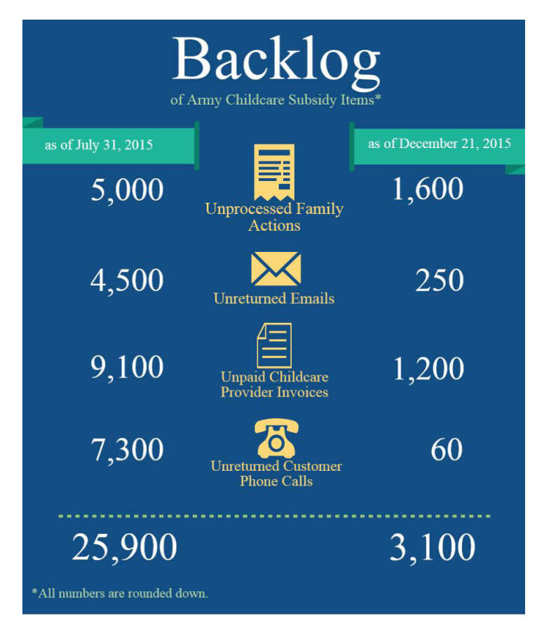
Figure 2. Backlog of Army Childcare Subsidy Items.

unreturned emails, 1,200 unpaid childcare provider invoices, and 60 unreturned phone calls). See Figure 2.