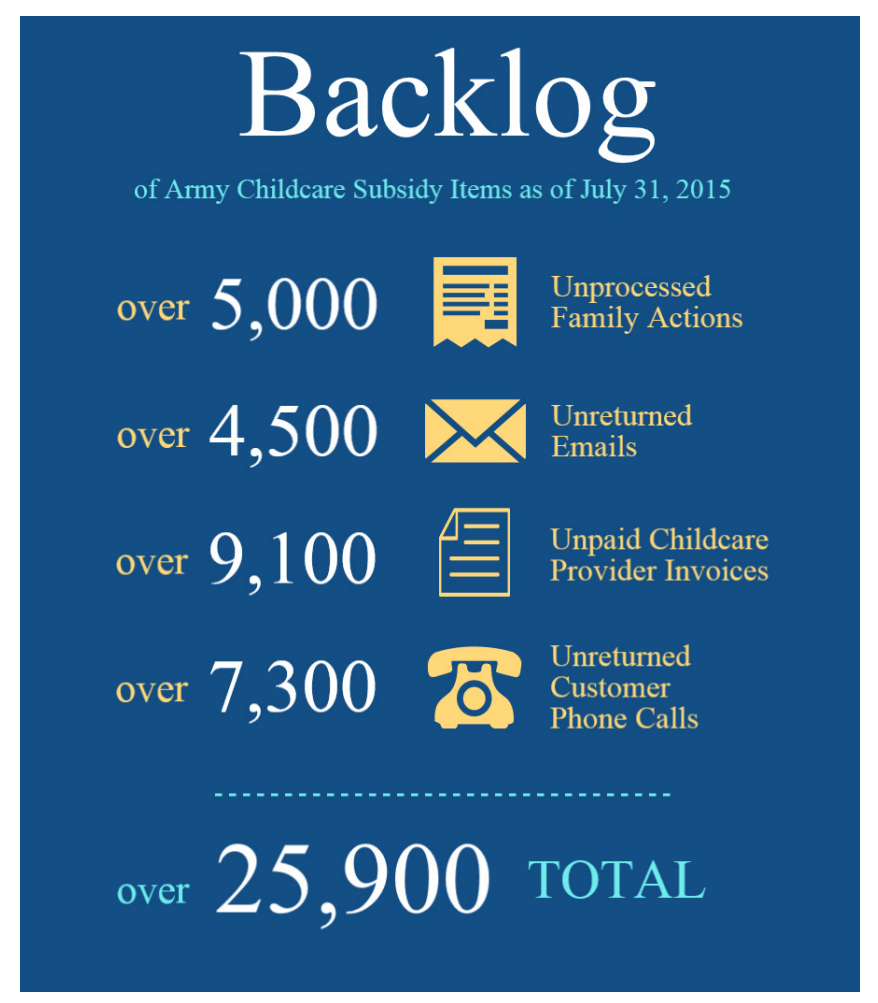
Figure 4. Backlog of Army Childcare Subsidy items as of July 31, 2015

Despite the efforts taken to address problems in administering the expanded program, GSA reported to the OIG on July 31, 2015, that the inventory of Army childcare subsidy items requiring action has increased to over 25,900 (see Figure 4). The backlog includes unprocessed family actions, unreturned emails, unpaid childcare invoices, and unreturned customer phone calls.