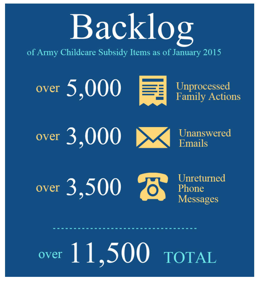
Figure 3. Backlog of Army Childcare Subsidy items as of January 2015