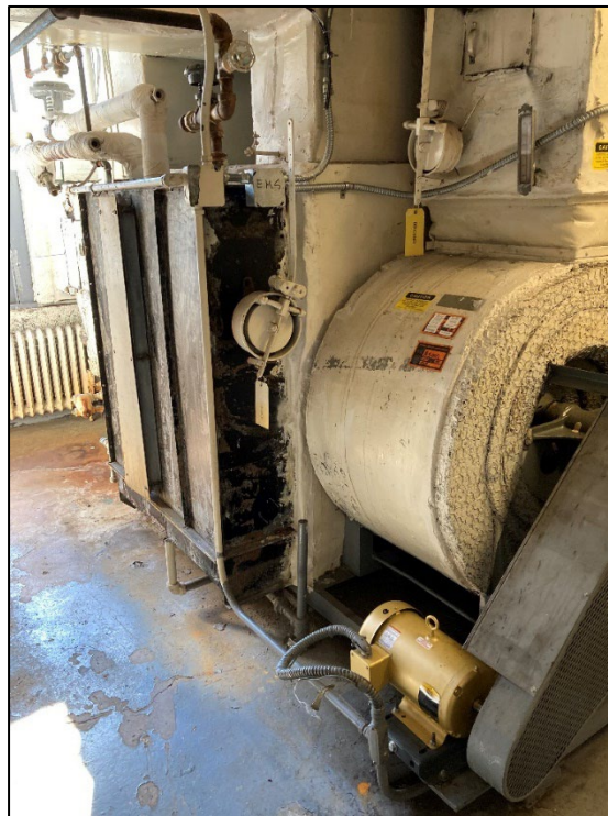
Figure 1 – AHU in the GSA Headquarters Building, Washington, D.C. 9

U.S. Department of Agriculture South Building, Washington, D.C. According to the O&M contractor's chief engineer, the South Building has seven wings, three of which have been