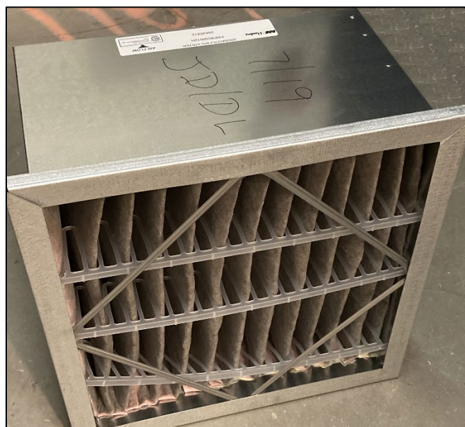
Figure 5 – Air Filter in Operation at the Mary E. Switzer Federal Building, Washington, D.C. 13

James R. Browning U.S. Courthouse, San Francisco, California. During our inspection, the O&M contractor’s chief engineer told us that they changed air filters either quarterly or annually, depending on the location of the air filter within the AHU. We observed air filters that the O&M