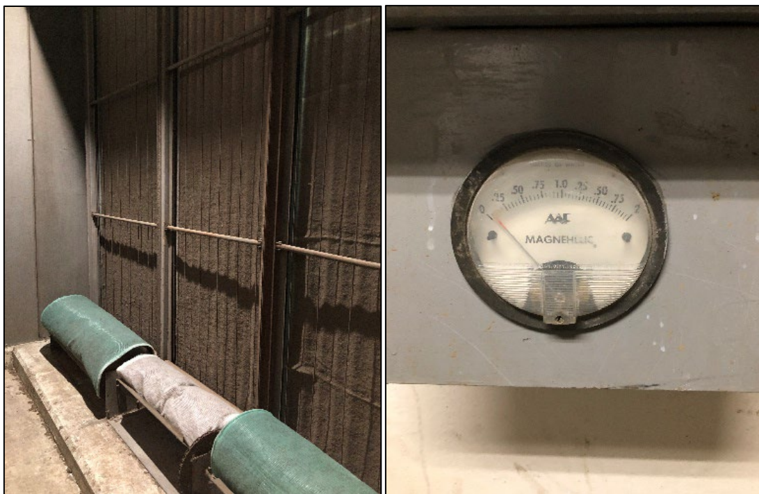
Figure 3 – AHU and Magnehelic Gauge Display in the James V. Forrestal Federal Building, Washington, D.C. 11

2306 East Bannister Road, Kansas City, Missouri. We observed a broad mix of old and new AHUs during our inspection of this facility (see Figure 4 on the next page). The O&M contractor's project manager told us that some units are original to the building, which was built in 1960, and use MERV 8 air filters. He also told us that the older AHUs cannot handle MERV 13 or higher rated air filters.