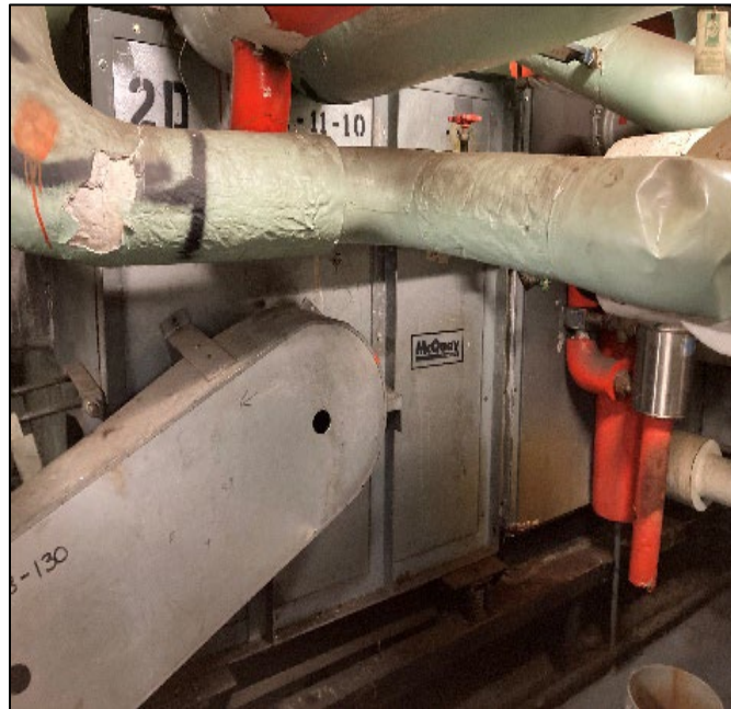
Figure 2 – AHU in the U.S. Department of Agriculture South Building, Washington, D.C. 10

GSA entered into a Delegation of Authority agreement for this facility with the U.S. Department of Agriculture in 1984. This agreement delegates the operation, maintenance, repair, preservation, alteration, and protection of the building to the U.S. Department of Agriculture. Accordingly, the PBS building manager told us that they did not collect air filter information for delegated facilities.