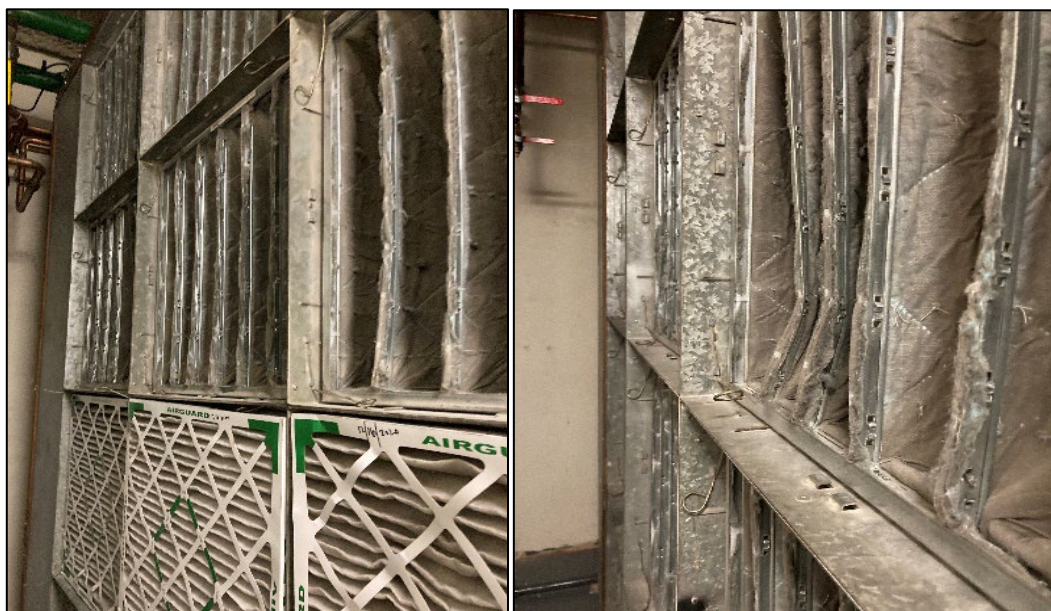
Figure 8 – AHU with Missing Air Filters at the Airport Corporate Centre, Oakland, California 16

In sum, PBS building managers for 13 of the 16 leased spaces we inspected told us that GSA does not inspect mechanical rooms. Instead, building managers told us that annual inspections of lease locations are typically limited to areas such as cleaning, repair and alteration projects, and space configuration. However, PBS has much broader access rights available under GSAM 552.270-9, Inspection—Right of Entry . PBS should exercise these rights to periodically inspect mechanical rooms to ensure that air filters meet lease requirements and help prevent workplace exposures to airborne viruses, including the virus that causes COVID-19.