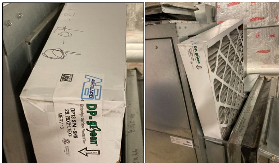
Figure 7 – Air Filter in an AHU at the HHS Parklawn Office Building, Rockville, Maryland 15

We requested that PBS provide us with the preventive maintenance records for this facility. In response, the PBS National Capital Region Chief of Staff told us that the lessor was unable to provide the records because it performs repair and maintenance work using the building engineer instead of an O&M contractor. However, regardless of whether the work is performed by the building engineer or by a contractor, the lessor should have preventive maintenance records available in accordance with the lease agreement.