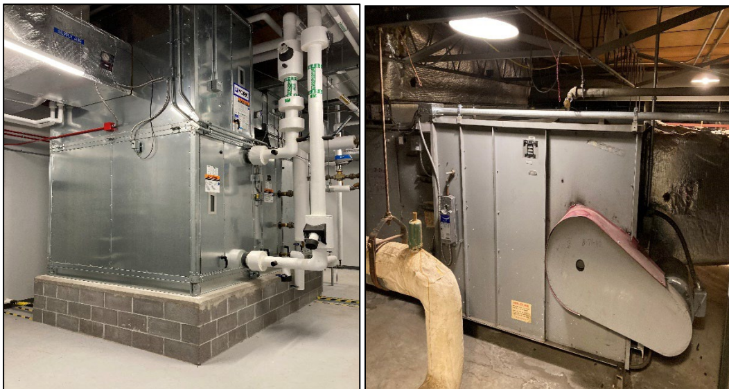
Figure 4 – AHUs at 2306 East Bannister Road, Kansas City, Missouri 12

Due to the age and condition of HVAC systems in many GSA-owned facilities, PBS faces challenges with full adoption of the CDC’s air filtration recommendations and guidance to help prevent workplace exposures to airborne viruses, including the virus that causes COVID-19. Accordingly, PBS should take steps to maximize central air filtration in existing HVAC systems without significantly reducing airflow.